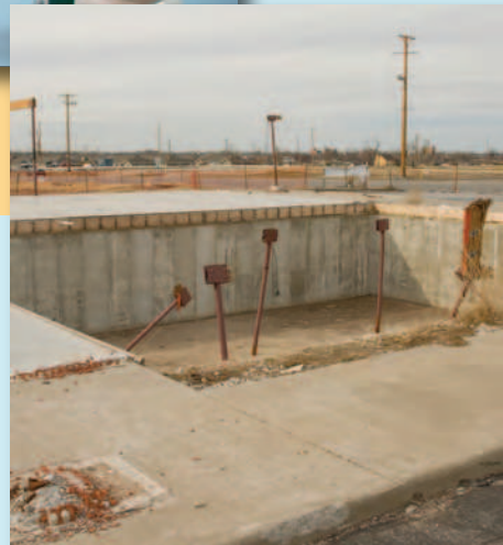
The remainder of the Starrett's former pharmacy location on East 20th Street after debris clean-up.

David ('77) and Sheree Starrett ('77) find a new home for their pharmacy practice in Joplin following the devastation to their former location on East 20th Street.