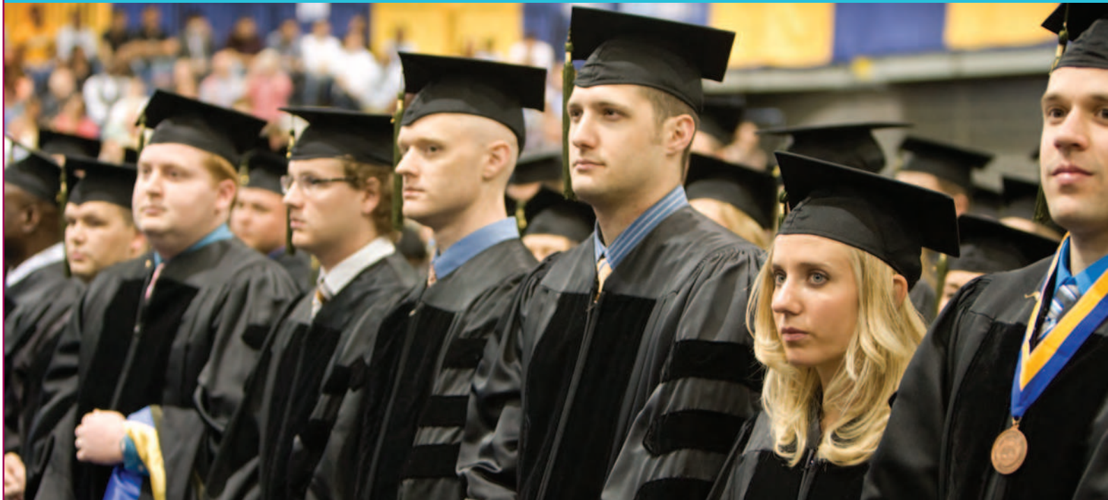
Doctor of Pharmacy candidates prepare to cross the stage for their doctoral hooding.