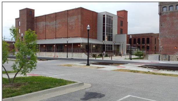
UMKC School of Pharmacy at MSU