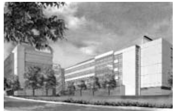
Health Sciences Building view from the northeast.

Post Script is published twice yearly by the UMKC School of Pharmacy, the Pharmacy Alumni Association and the Pharmacy Foundation.